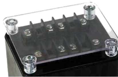
Clear Plastic Cover