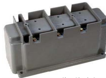
Clear Plastic Cover